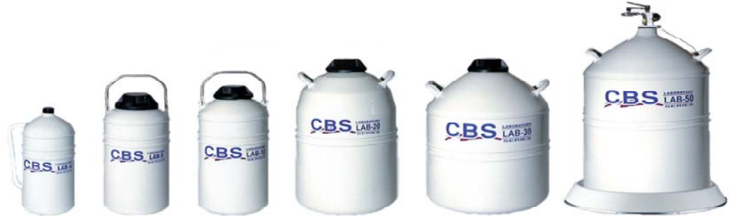
Lab 50 Shown with Optional Roller Base & Withdrawal

The LAB Series dewars use high efficiency super-insulation and aluminum construction to make them lightweight and the most efficient containers available. Their shape and handles make them easy to lift and pour. The LAB Series dewars can also be fitted with pouring spouts, withdrawal devices, or dippers to aid in liquid nitrogen transfer.